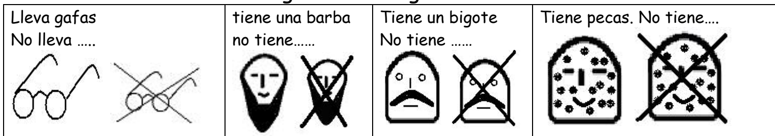
He/she wears glasses